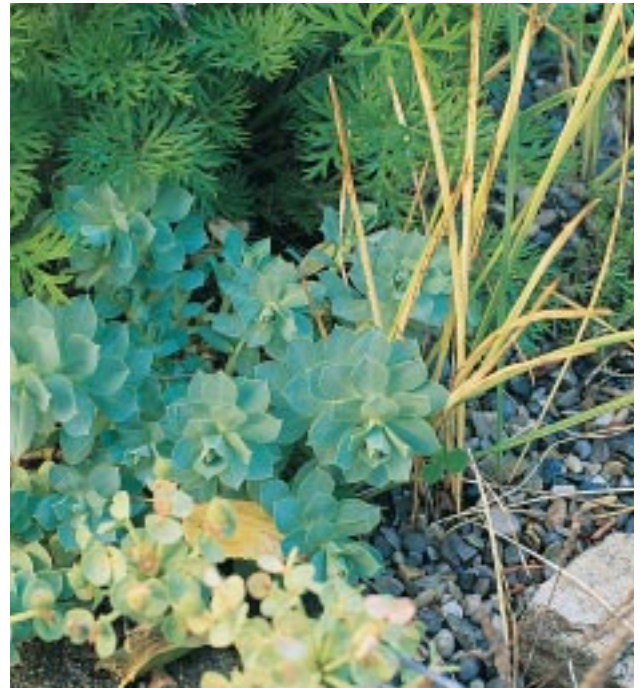
FACING PAGE: The first rock garden at Anne Vale's was built on poor, sandy, gravelly soil. TOP: Partridge feather and Sedum "Bronze Carpet" contribute summer-long colourful foliage. BOTTOM LEFT: Space is not an issue if gardeners take inspiration from Vale's alpine trough gardens. BOTTOM RIGHT: Euphorbia myrsinites has great texture but is listed as a zone 6 plant and may be short-lived in Alberta.